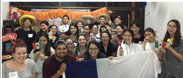
Fiesta with the UTSA team / right: Together19